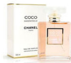
51 COCO MADEMOISELLE CHANEL