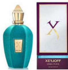
129 ERBA PURA XERJOFF (UNISEX)