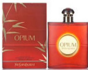
6 OPIUM YSL