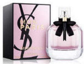
89 MON PARIS YSL