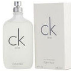
46 CK ONE CALVIN KLEIN