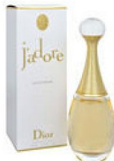
7 J'ADORE DIOR