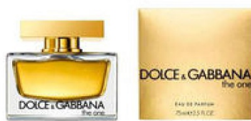
70 THE ONE D&G