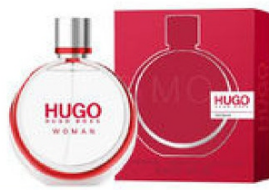
63 HUGO HUGO BOSS