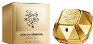
19 LADY MILLION PACO RABANNE