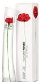
26 FLOWER KENZO