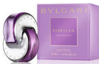
57 OMNIA AMETHYSTE BULGARI