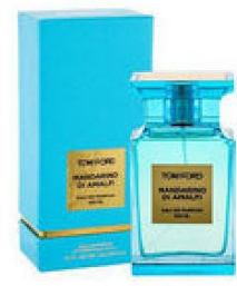
99 MANDARINO DI AMALFI TOM FORD