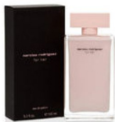
25 FOR HER NARCISO RODRIGUEZ