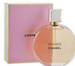
85 CHANCE CHANEL