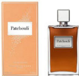
72 PATCHOULI REMINESENCE