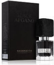
74 BLACK AFGANO NASOMATTO (HERREN)