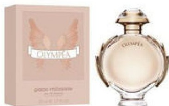
67 OLYMPEA PACO RABANNE