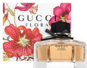
77 FLORA GUCCI