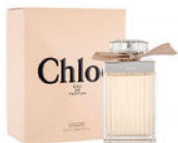
41 CHLOE CHLOE