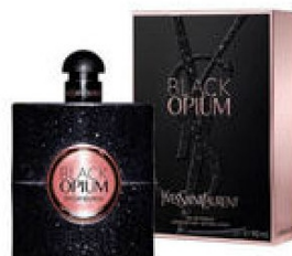
55 BLACK OPIUM YSL