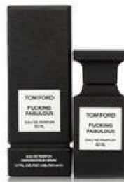
106 FUCKING FABULOUS TOM FORD (UNISEX)