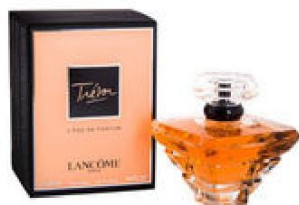
27 TRESOR ANGEL LANCÔME