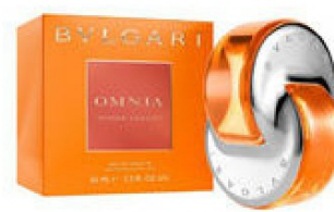
64 OMNIA INDIAN GARNET BULGARI