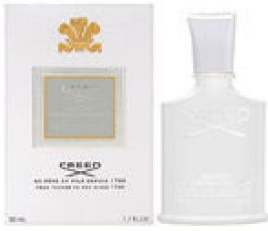
44 SILVER MOUNTAIN CREED