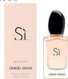
80 SI ARMANI