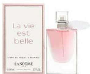
42 LA VIE EST BELLE LANCÔME