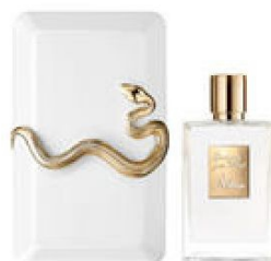
123 GOOD GIRL GONE BAD KILIAN (DAMEN)