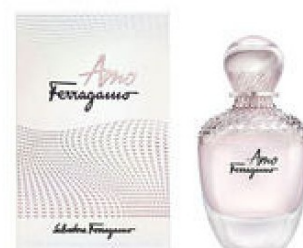
97 AMO FERRAGAMO SALVATORE FERRAGAMO