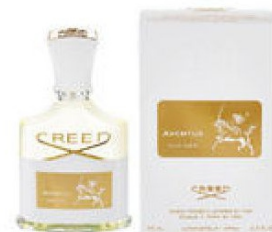
93 AVENTUS FOR HER CREED