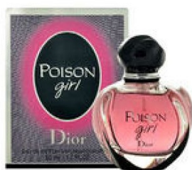
90 POISON GIRL DIOR