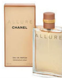
71 ALLURE CHANEL