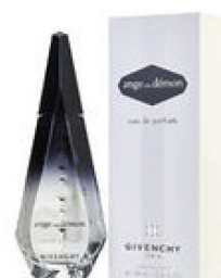
56 ANGE OU DEMON GIVENCHY