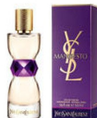
14 MANIFESTO YSL