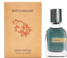
130 ORTO PARISI MEGAMARE (UNISEX)