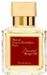
118 BACCARAT ROUGE 540 MAISON F. KURKDIJAN (UNIS.)