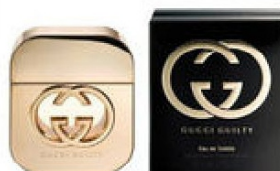
13 GUILTY GUCCI