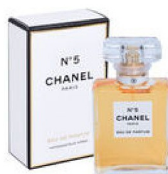
24 CHANEL N°5 CHANEL