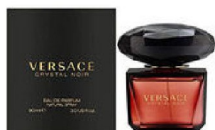
47 CRYSTAL NOIR VERSACE