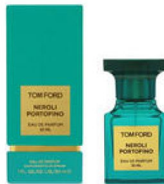
112 NEROLI PORTOFINO TOM FORD (UNISEX)