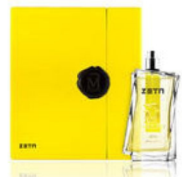
124 ZETA MORPH (UNISEX)