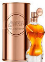
81 CLASSIQUE ESSENCE JPG