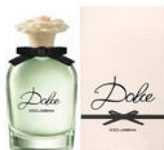
49 DOLCE D&G