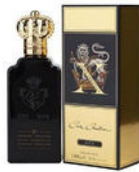
75 „X“ FOR MEN CLIVE CHRISTIAN (HERREN)