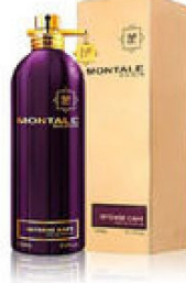
105 INTENSE CAFE MONTALE