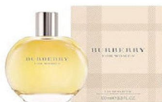
95 BURBERRY BURBERRY