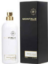
100 WHITE Aoud MONTALE