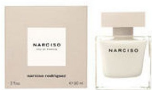
53 NARCISO NARCISO RODRIGUEZ