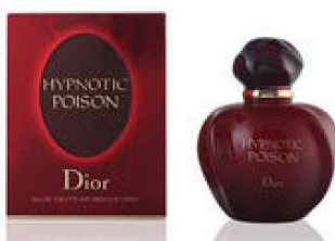
23 HYPNOTIC POISON DIOR