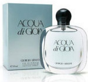
76 ACQUA DI GIOIA ARMANI