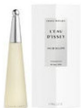
29 L'EAU D'ISSEY ISSEY MIYAKE