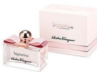
82 SIGNORINA SALVATORE FERRAGAMO