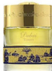
141 THE SPIRIT OF DUBAI TURATH (UNISEX)