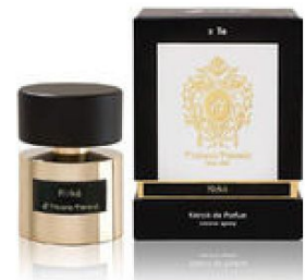
110 TIZIANA TERENCE KIRKE