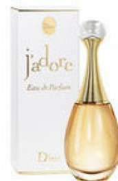
109 J'ADORE L'OR DIOR (DAMEN)