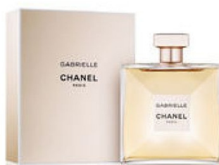
96 GABRIELLE CHANEL