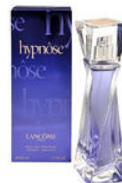
40 HYPNOSE LANCÔME