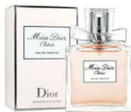
39 MISS DIOR CHERIE DIOR