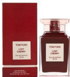
111 LOST CHERRY TOM FORD (UNISEX)