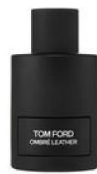
142 OMBRE LEATHER TOM FORD