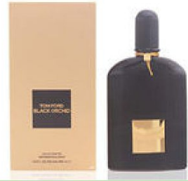
54 BLACK ORCHID TOM FORD