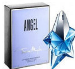
28 ANGEL THIERRY MUGLER