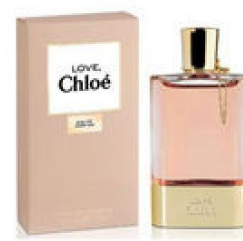
43 LOVE CHLOE CHLOE