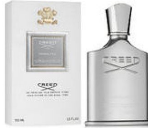
73 HIMALAYA CREED