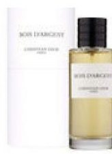
135 BOIS D' ARGENT CHRISTIAN DIOR